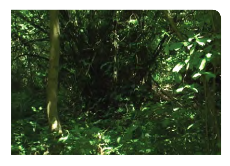
Invisible Intruder with standard daylight CCD camera