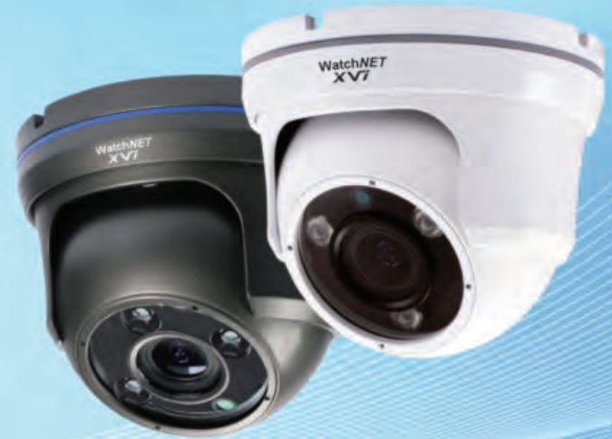
XVI-21IRBVM-B / XVI-21IRBVM-W

HD IR Vari-Focal Dome Camera Motorized ZOOM/FOCUS