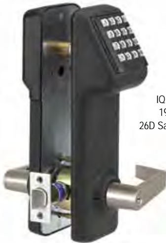
IQ1LITE Cylindrical Model Shown; 19 Black Powder Coat finish with 26D Satin Chrome Plated American Levers