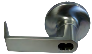
LX180R 626 IC