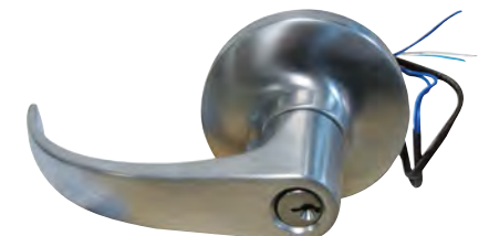
L180CE FSE 12VDC 626 C REX