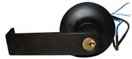
L180RE FSE 12VDC 613 C REX