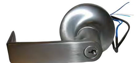
L180RE FSE 12VDC 626 C REX