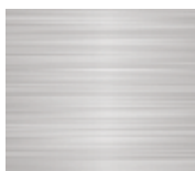
US26D Satin Chrome