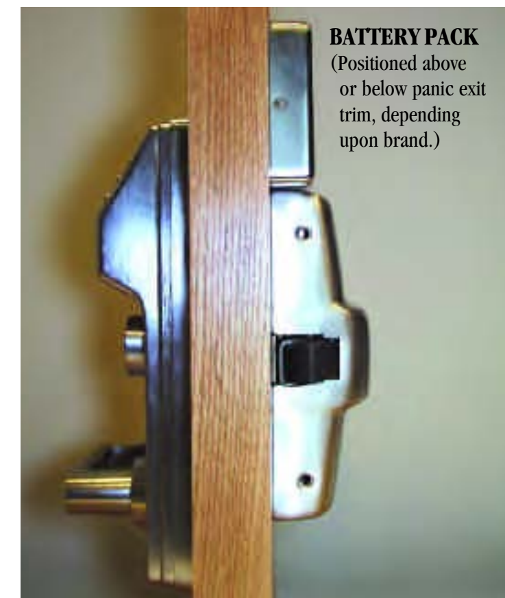
BATTERY PACK (Positioned above or below panic exit trim, depending upon brand.)