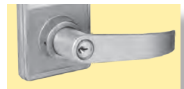
Regal handle option

COMPLIANCES: Grade I, heavy duty cylindrical lockset, UL listed to the 10C Positive Pressure Specification and FCC certified. ADA compliant levers.