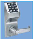
Weather-Resistant Lever with IC Core in 26D DL2800IC/26D