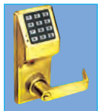
Weather-Resistant Lever in US3 DL2800/3