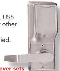
Lever sets feature clutch mechanism ensuring longer life and complies with ADA specs providing barrier-free access to the disabled.