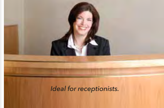
Ideal for receptionists.