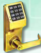
Lever set in US3 DL2700/3