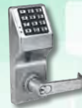
With IC Core in 26D DL2700IC/26D