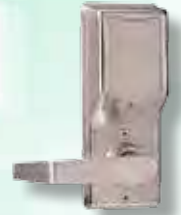
Secure battery compartment on inside door