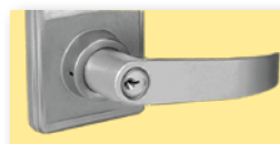
Regal handle option

POWER: 5AA alkaline batteries, supplied. Audible low battery alert, visual and audible entry indicators, 60,000 cycles typical.