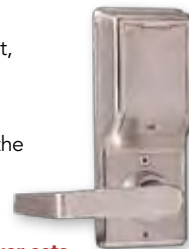
Lever sets feature clutch mechanism ensuring longer life and complies with ADA specs providing barrier-free access to the disabled.

PROGRAMMING: Locking modes, event schedules, group, individual, master, management, passage, emergency service codes. Lockout, remote override capability and allowable entry time (3, 10 or 15 seconds), are programmable through the keypad, AL-DTMIII or Alarm Lock's DL-Windows PC Software.