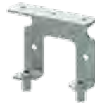
9550-3018 Rear Mounting Bracket