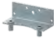
9550-275 Mounting Bracket