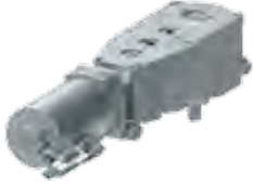
9550-3454 Motor Gearbox