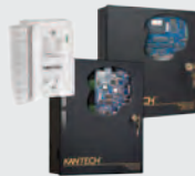
Kantech Door Controller Family