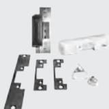
DK-1 Door Hardware Kit