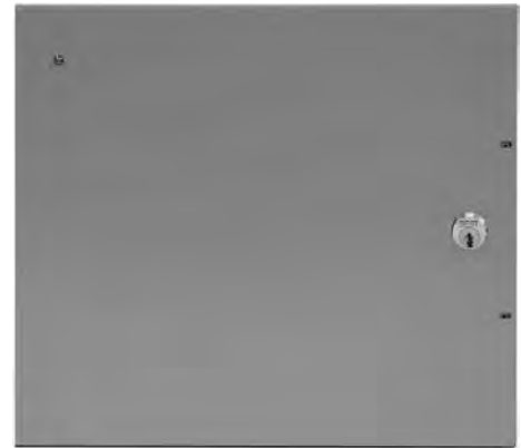
ELR150 Power supply door closed