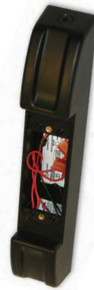
104753-J Jamb Mount Box/Transmitter