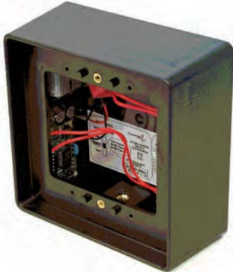
104753 - 4" Box/Transmitter

The 104753 Transmitter provides the most reliable wireless activation of automatic doors available.