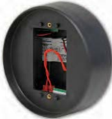
104753-R4 - 4" Round Box/Transmitter 104753-R6 - 6" Round Box/Transmitter