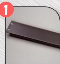
Solid Aluminum .060" Thick Filler Panel