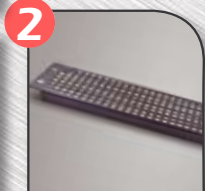
Vented Steel .060" Thick Filler Panel