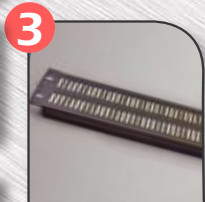
Vertical Slotted Steel .060" Thick Filler Panel