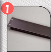
Solid Steel .060" Thick Filler Panel