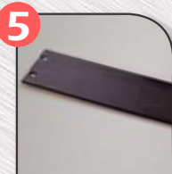
Solid Flat Aluminum .125" Thick Filler Panel

A wide array of rack mount aluminum filler panel options are available for your Stantron® products. Panels are available in solid, perforated, vertical slotted, or horizontal slotted styles. Also available in a solid flat filler panel without flanges.