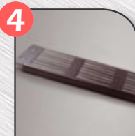
Horizontal Slotted Aluminum .060" Thick Filler Panel