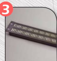
Vertical Slotted Aluminum .060" Thick Filler Panel