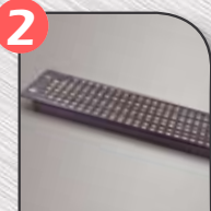
Vented Aluminum .060" Thick Filler Panel