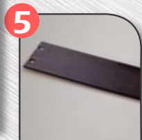
Solid Flat Steel .105" Thick Filler Panel