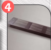
Horizontal Slotted Steel .060" Thick Filler Panel