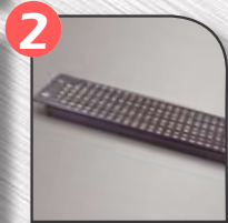
Vented Steel .048" Thick Filler Panel