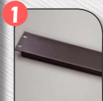
Solid Steel .048" Thick Filler Panel