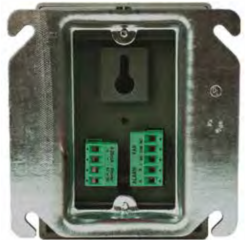
CM-6 Rear View