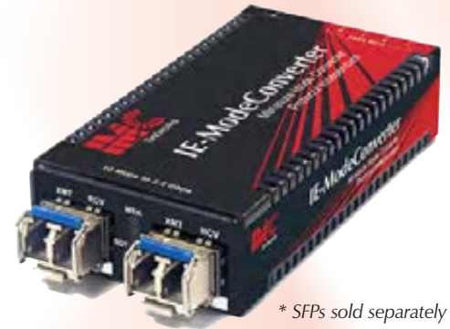
* SFPs sold separately

Connect network segments running different fiber types using interchangeable SFP modules.