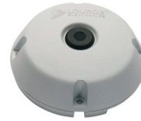
Verifact® A Microphones