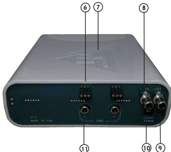
Fig. 2 Rear view of AP-2