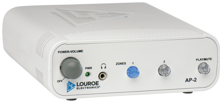
AP-2 Base Station

The ASK-4® 122 is a two zone audio monitoring system designed to interface with a DVR, VCR or other recording device that accept line level audio. The AP-2 Audio Base Station has 2 microphone inputs, contains a built-in 3' speaker and volume control for producing live audio and playback. It has loop out RCA output per microphone so each microphone can be recorded individually. It also has a selectable audio output that produces audio to a recorder for that zone or microphone selected. The Verifact® A microphones are omnidirectional pre-amplified microphone that produces line level audio output.