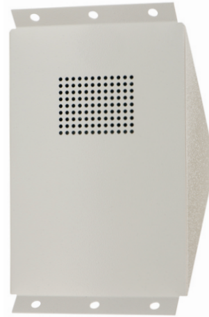
TLSP CORNER MOUNT