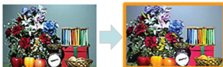
Still Object under Artificial Sunlight