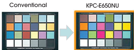
Color Chart Under Halogen Lamp

KPC-E650NU is equipped with more excellent color reproduction from wide range of ATW. (1,800K to 10,500K)